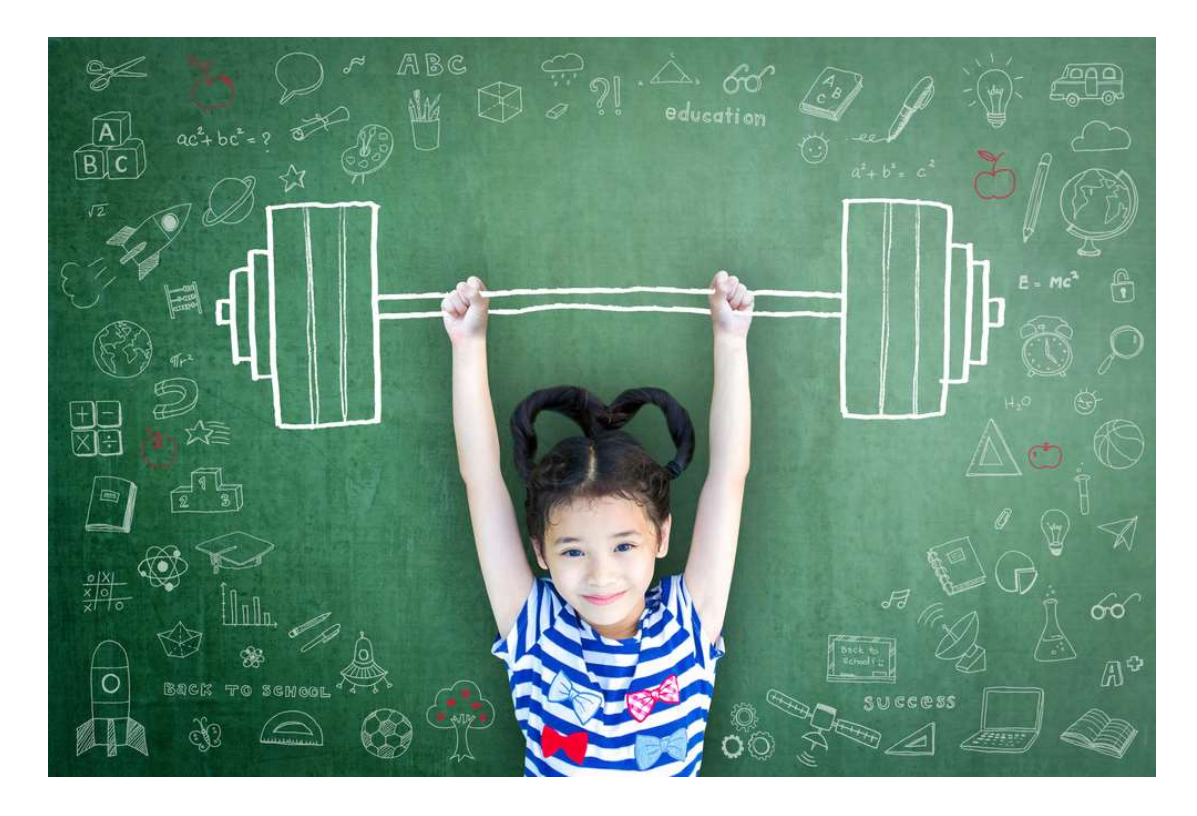
Written by: geneDecode Genetics Education Professional Team

Innate potential is an ability that everyone is born with, a genetic characteristic that is present before growth. From birth, each child possesses their own unique talents. In the process of a child's growth, emotional intelligence, IQ, and the ability to withstand setbacks, among others, are all necessary conditions for success. Among these conditions, each child's talents are different. Can we discover their innate talents in the innocent eyes of children? Can we be sure to capture these talents and guide the children on a path of growth that suits them?